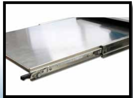
MARINE GRADE STAINLESS STEEL TRAYS WITH LOCK IN/OUT DESIGN