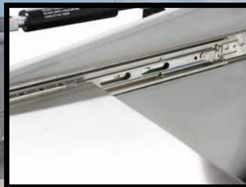
INDUSTRIAL STRENGTH EASY SLIDE RAILS