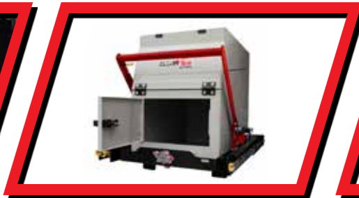
74 LITRES OF LOCKABLE STORAGE