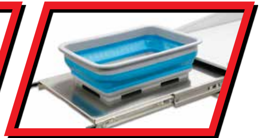
EVEN COMES WITH COLLAPSIBLE WASH BASIN