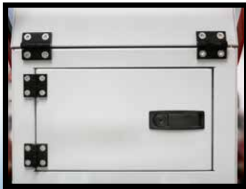
HEAVY DUTY HINGES AND LOCK